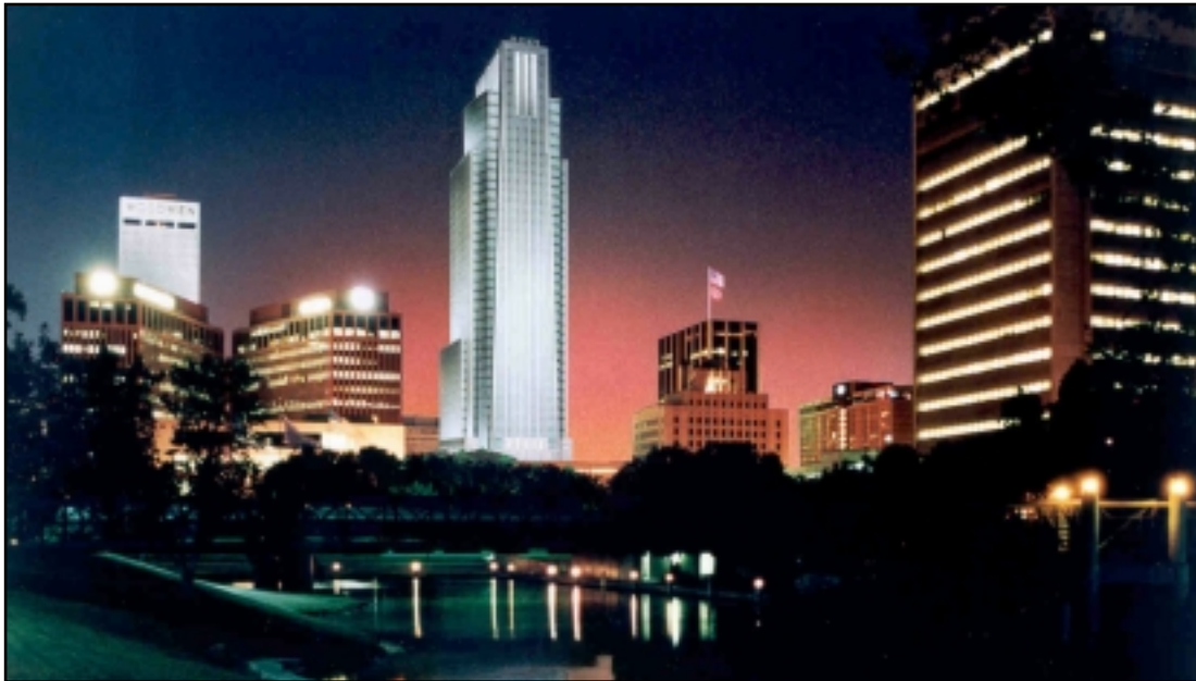
Night skyline of Omaha, NE, with First National Bank Tower illuminated at center

for expansion or separation joints or post-tension construction so the structural steel Tower and cast-in-place parking garage were designed as a single structure.