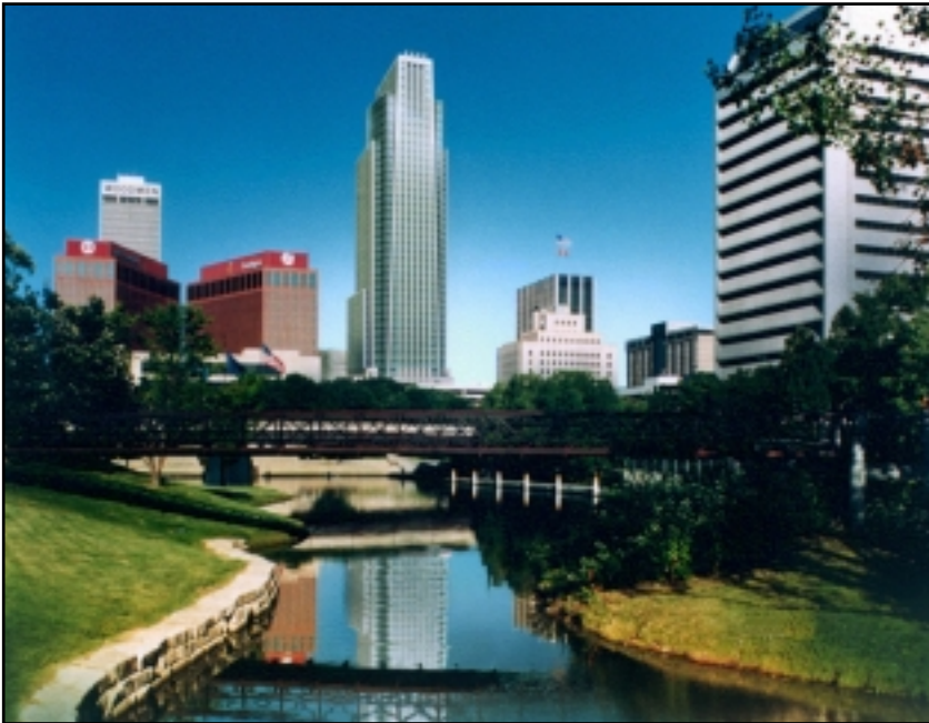
First National Bank Tower rises high above the Omaha skyline.

cubic yards of structural lightweight concrete, which was placed by concrete pump. The mix contained Vacuum Saturated expanded shale lightweight aggregate from Buildex Inc's New Market Missouri plant. In addition to using pre-saturated lightweight aggregate, pumpability of the mix was aided by the incorporation of Ash Grove Cement Company's Duracem Type IP pozzolan cement.