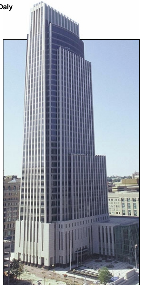
At 633 feet, the First National Tower is the tallest building in the upper midwest between Denver and Minneapolis.

Lightweight concrete was selected for the floor slabs on metal deck in the First National Tower to minimize